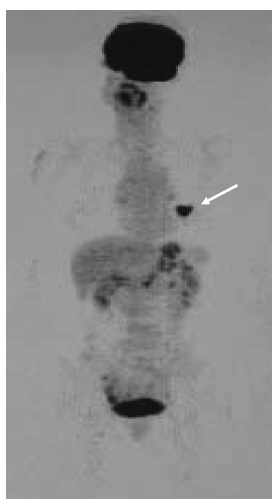
Fig. 2. Positron emission tomography image shows intense uptake of [ ^{18}\text{F} ]fluorodeoxy-D-glucose in the left lung tumor, but no uptake in the right lung tumor ( arrow ).

tion. The intraoperative pathological diagnosis by frozen section was hamartoma. The patient then underwent left lower lobectomy with ND2a mediastinal lymph node dissection under VATS in the right decubitus position. The reason that she underwent left lower lobectomy and lymph node dissection rather than partial resection was the size (diameter > 3 cm) of the tumor. The operating time was 220 minutes, and the total blood loss was 50 g. The pathological diagnosis of the right lung tumor was chondromatous hamartoma (Fig. 3, A, B), and the left lung tumor was a moderately-differentiated tu-