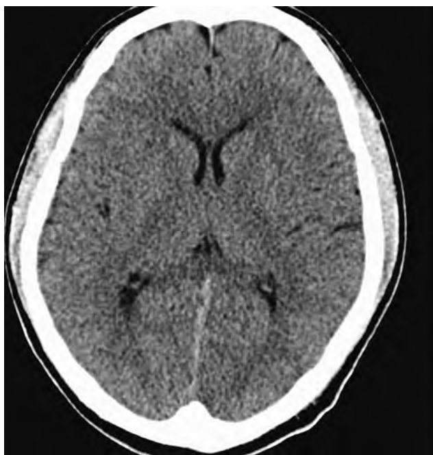
Figure 3 Head computed tomography scan revealed no abnormalities just after termination of the second HBOT session.

certified by manufacturers are widely used in European countries (9). Risk factors for seizures associated with HBOT include hypercapnia (4). In the present case we were forced to supervise the patient without any medical equipment like monitoring devices or syringe pumps. Mechanical monitoring of respiratory rate or capnometer would have prevented the occurrence of seizure in this case. Thus, sufficient medical equipment could be beneficial for the safe and efficient management of patients.