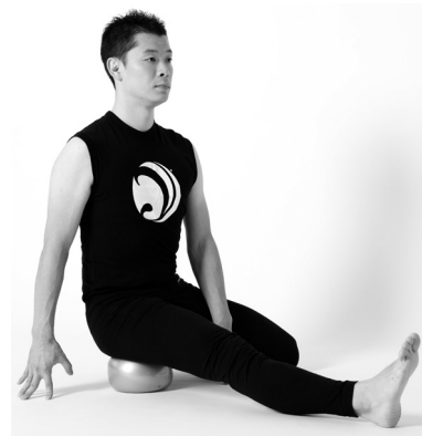
Fig. 2. Hamstrings Routine

The denser silver ball is 23 cm in diameter and is used for stimulating especially lower extremities by advance users. For small body parts such as the calf and hip, the calf (black) ball, which is 10 cm in diameter, is suitable. Recently, a blue ball made with the same hardness as the silver ball has been produced for advanced usage as a calf ball. The face ball is customized for facial use, and hemisphere-shaped foot wakers and foot savers can especially stimulate the feet. By choosing and using a variety of tools, total body self-conditioning is possible (Fig. 1).