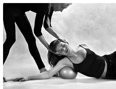
Fig. 4. Sideline Routine

Place the ball under the right greater trochanter and stabilize the body as straight as possible with the right hand or forearm on the floor. Breathe deeply to sink the body into the ball. Next, move the body downward to stimulate the iliac crest, and lift up the right rib cage with the left hand to