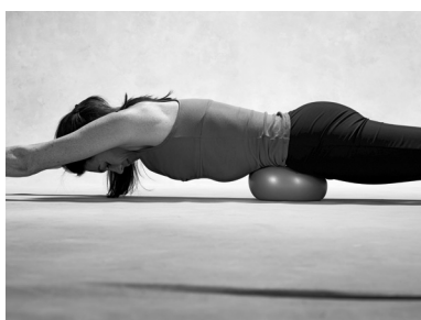
Fig. 3. Abdominal Routine